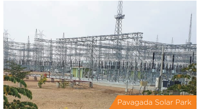
Pavagada Solar Park

The entire Pavagada Solar Park has been divided into 40 blocks each of 50MW. The delegates were shown Fortum & Renew Block while passing the ring road to Pavagada. The delegates were also shown the PGCIL station. The 400/220KV Pavagada SS was commissioned in 2017 for evacuation of 2000 MW of solar power generated by the park. Pavagada SS is equipped with 5 Nos 500 MVA, 400/220kv transformers, 2 nos 125MVar, 400 kv Bus reactors.