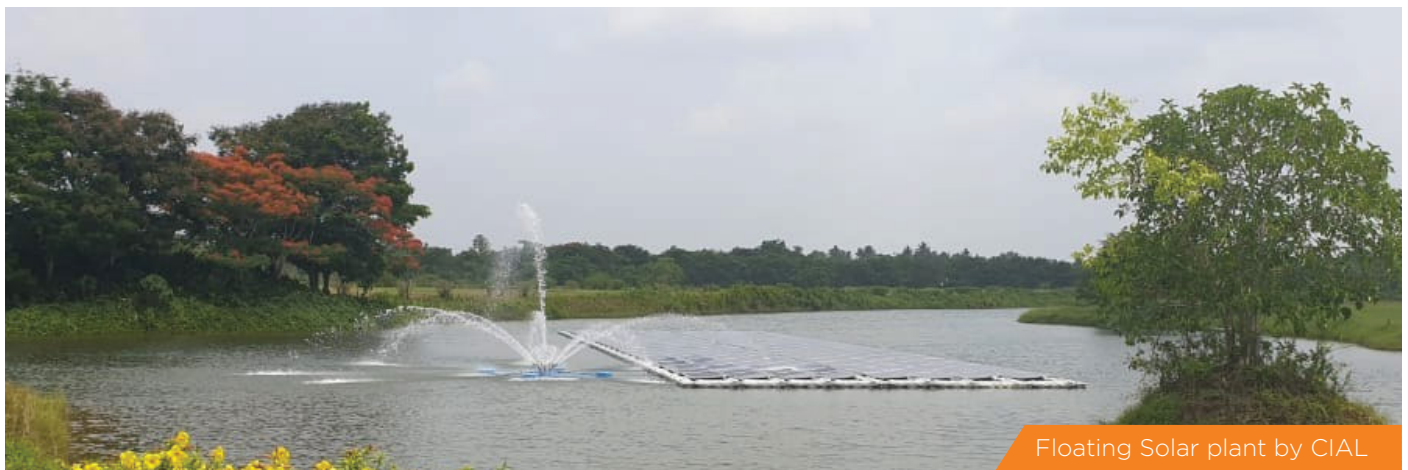
Floating Solar plant by CIAL

A total installed capacity of 450 KWp is envisaged through these plants. At present CIAL's total installed capacity is 40 MWp producing 1.63 lakhs unit of power a day whereas the requirement stands at 1.53 lakhs units.