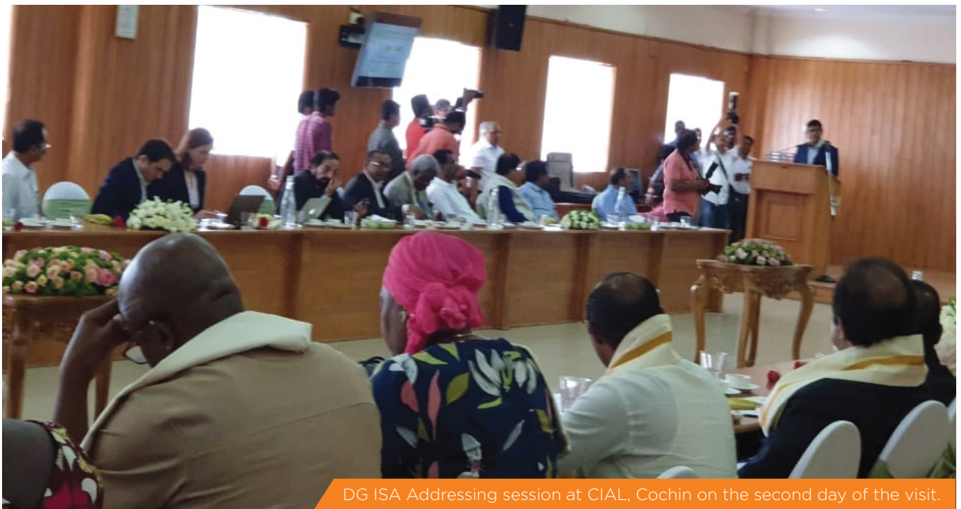
DG ISA Addressing session at CIAL, Cochin on the second day of the visit.

As part of International Solar Alliance (ISA)'s initiative to find out suitable models to be incorporated to achieve its ambitions plan of massive deployment of solar energy, the delegation was taken on a visit to Cochin International Airport on 22 nd May 2019.