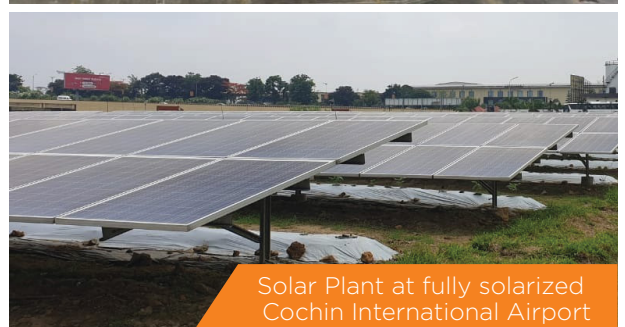
Solar Plant at fully solarized Cochin International Airport