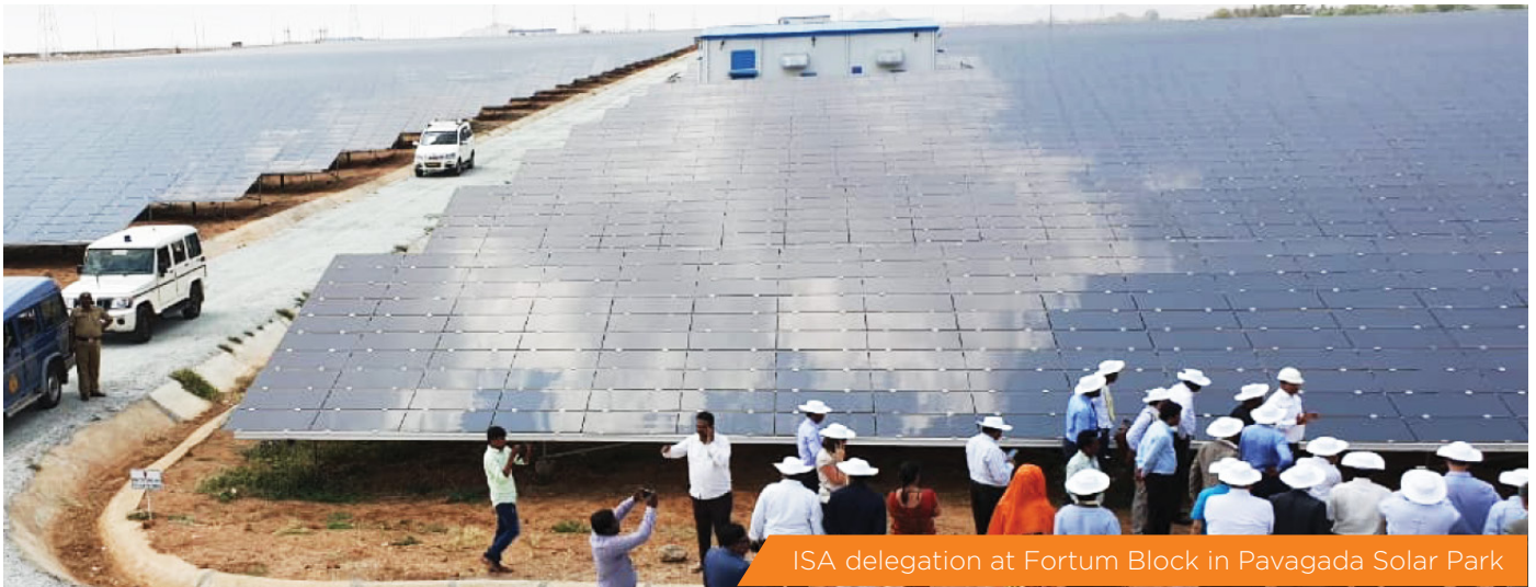
ISA delegation at Fortum Block in Pavagada Solar Park

Jawaharlal Nehru National Solar Mission (JNNSM) launched by the Ministry of New and Renewable Energy, Govt has target of 20,000 MW by the year 2022 which has been revised up to 100 GW by the Government of India. Karnataka is one of the states in India which is implementing multi MW capacity projects in the state under the state policy of solar power generation.