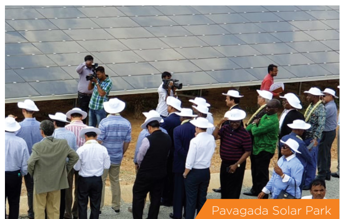
Pavagada Solar Park