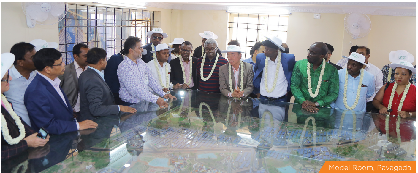
Model Room, Pavagada

During the visit ISA delegation traveled to World's largest 2000 MW Pavagada solar park, which was 260 KM from Bangaluru airport. The high level delegation received excellent hospitality from the state. During the visit, the delegates were shown the Model Room where a model of Pavagada solar park is kept for the benefit of the visitors.