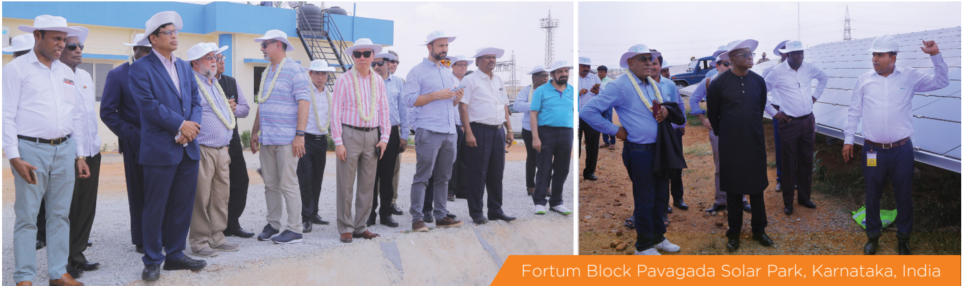
Fortum Block Pavagada Solar Park, Karnataka, India