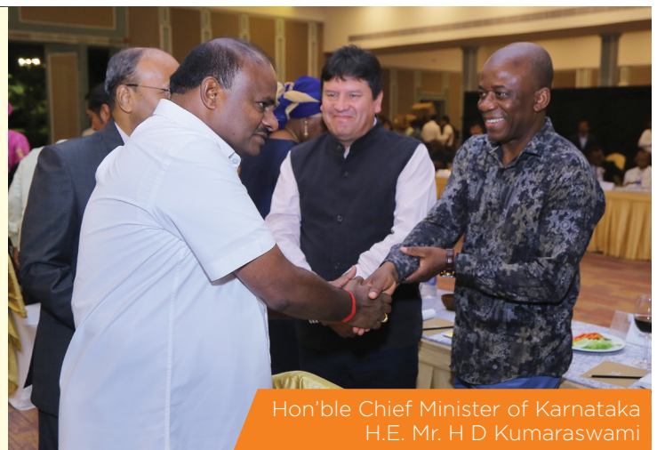
Hon'ble Chief Minister of Karnataka H.E. Mr. H D Kumaraswami

Officials of Karnataka and Kerala State Nodal Agencies along with CIAL and officials of Navalt.