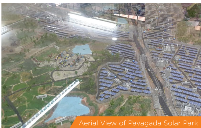
Aerial View of Pavagada Solar Park

In the state of Karnataka, the nodal agency Karnataka Renewable Energy Development Limited(KREDL) is taking care of its Solar Power Policy and initiative towards developing Solar Parks in the state. Karnataka Solar Power Development Corporation Limited(KSPDCL) was formed as a Joint venture between SECI & KREDL in March-2015 and it has taken the initiative in Tumakuru district to develop the first Solar Park of the State with a total capacity of 2000 MW. For this, KSPDCL has selected the land in Nagalamadike Hobli, Pavagada Taluk, Tumakuru Dist, Karnataka State to establish 2000 MW Solar Park. The selected project location is in 'Hot and Dry' climate zone of the country and hence experiences high solar irradiance (high DNI as well) and high ambient temperature. The expenditure towards implementation of the Solar Park will be met partly from grants from MNRE and partly from upfront charges collected from Solar Power Developers.