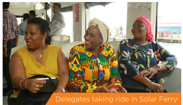
Delegates taking ride in Solar Ferry

The details of the departments and companies involved in the floating solar and solar ferry project will also be circulated to CPs and NFPs and ISA can attempt to aggregate demand for both from among the Member countries.