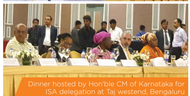
Dinner hosted by Hon'ble CM of Karnataka for ISA delegation at Taj westend, Bengaluru

On this occasion, Hon'ble CM announced INR100 million to be contributed towards ISA as a corpus to institute Visvesvaraya Award, named after India's highest honour recipient- scholar, statesman and eminent engineer, M Visvesvaraya who belonged to Karnataka.